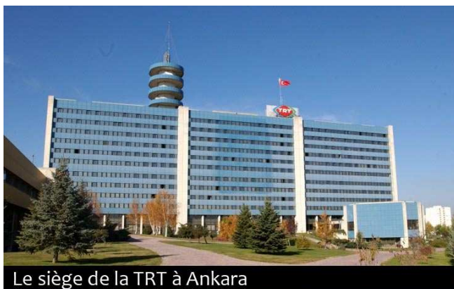
Le siège de la TRT à Ankara

Turkish Radio and Television ( TRT ) was created on May 1 st 1964 to broadcast state radio and television programmes, although its own specific law gave it independent status. Following the constitutional amendments of 1972, TRT was re-defined as an “impartial” public institution with a commercial nature . Following the provisions of the 1982 Constitution, the law on TRT was revised in 1984. In 1986 the possibility of